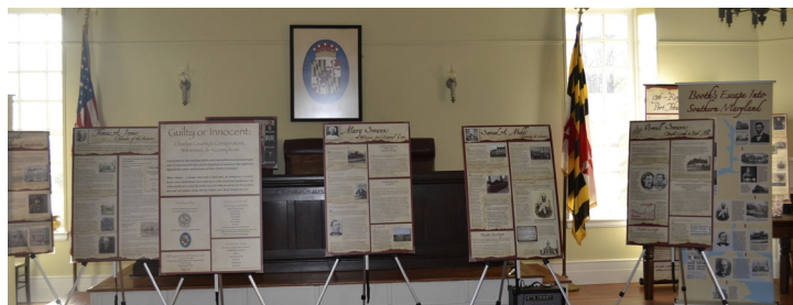
Panels of Charles County's Conspirators, Witnesses & Accomplices.