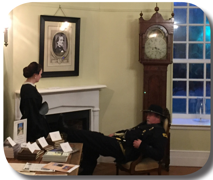
General Joseph Hooker resting his feet upon the andiron holding the secret message.