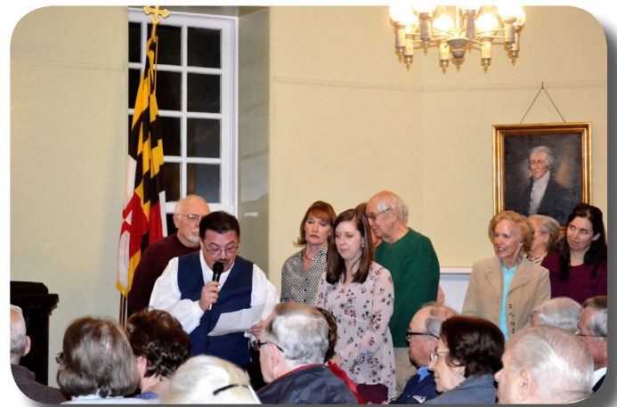
Auctioning of the Civil War themed baskets.