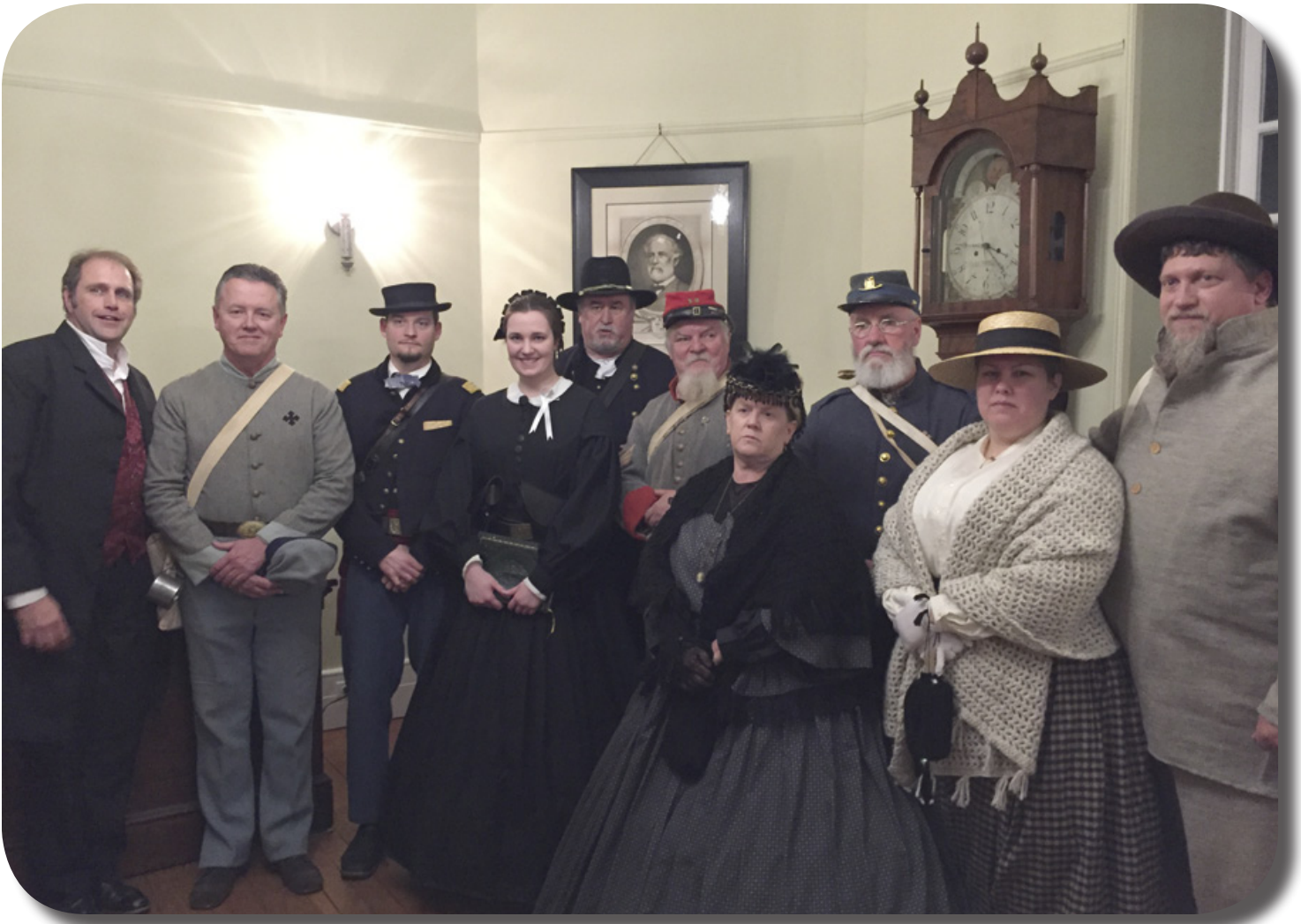
Cast of Characters.