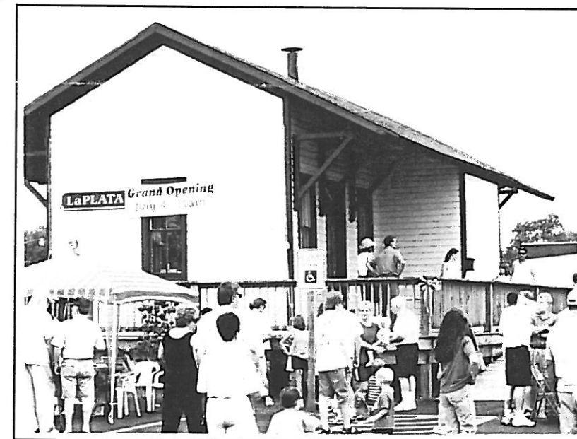
Visitors to the Grand Opening of The Train Station