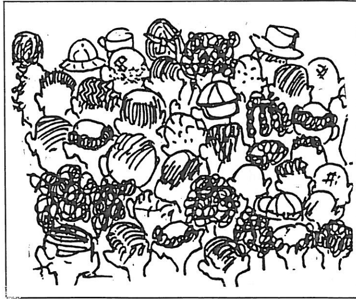
The Historical Society—A Great Crowd—Join In!

Let's see a crowd at the Train Station for this!