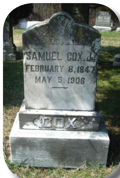
The photo on the left is Samuel Cox.